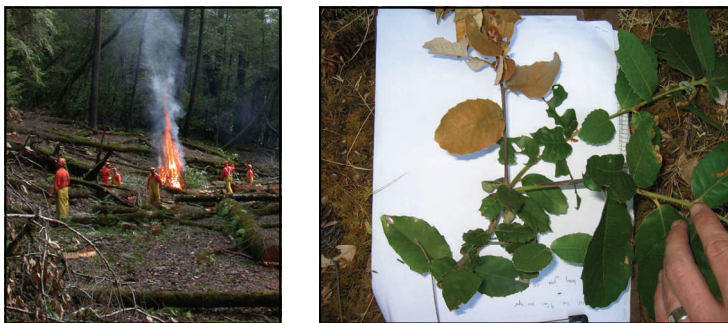
(Left) Pile burning after bay and tanoak removal in Humboldt County. (Right) Tanoak sprouts infected with P. ramorum (see blackened areas on twigs).

In southern Humboldt County, California, a fifty-acre infested site was treated by removal of all tanoak and bay laurel trees. Half the site was subsequently underburned. Repeated monitoring of the site has recovered P. ramorum from spore traps and soil only very infrequently, and almost always in association with heavy densities of bay laurel sprout clumps or where residual bay and tanoak trees were missed during treatment (Valachovic et al. 2009; Valachovic et al. 2008); however, because of dry winter and spring conditions since treatment, the study sites have not yet been subjected to heavy disease pressure. Together with the Oregon results, this suggests that burning can be a valuable tool in cleaning up small infectious material in infested sites but that the pathogen may persist at low levels. Beh et al. (2009) recovered P. ramorum from streams in Big Sur areas that had experienced severe wildfire (and no other treatment) the previous season. Those developing slow-the-spread strategies should keep in mind that a single round of treatments is not sufficient to eliminate the pathogen from a given site.