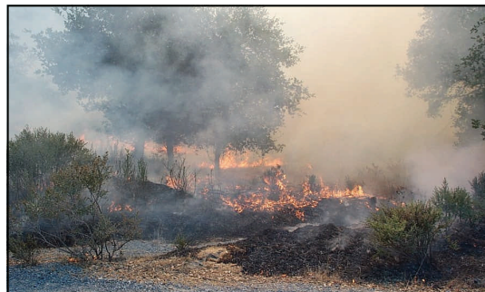
Smoke from prescribed burn in Marin County.