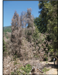
(Left) Surface fuel accumulation in a P. ramorum -infected stand in Big Sur. (Middle) Creeping underburn in Marin County oak woodland. (Right) Ladder and crown fuels resulting from dead leaf persistence on tanoaks in Big Sur.